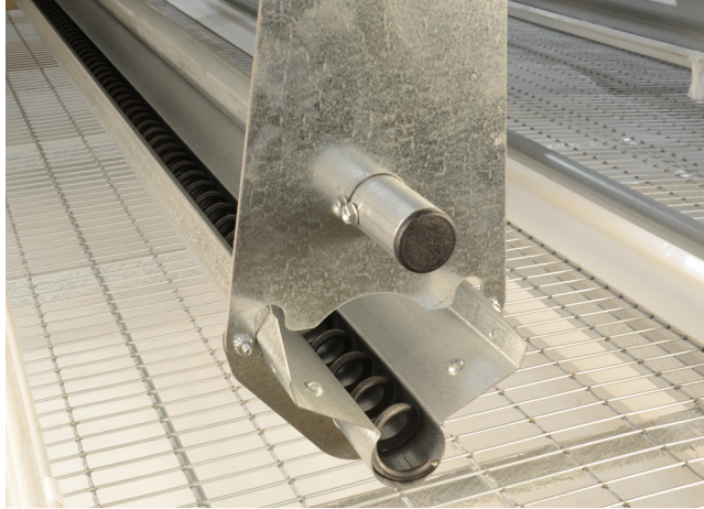
ULTRAFLO® Double-Sided Feeder for Commercial Cage-Free Layers