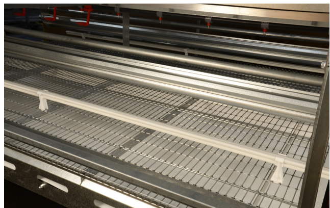
Manure belts on each level keep system and feeding areas clean