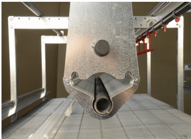
Multiple levels of ULTRAFLO® Feeders and Chore-Time drinkers allow easy access for birds on each level