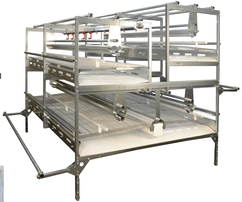
VIKE™ TRADITION™ Aviary System with Perches