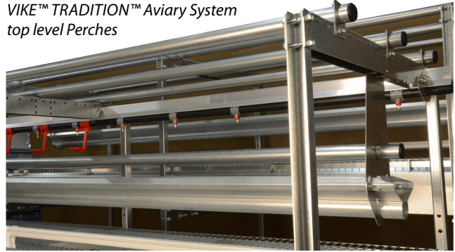
VIKE™ TRADITION™ Aviary System top level Perches