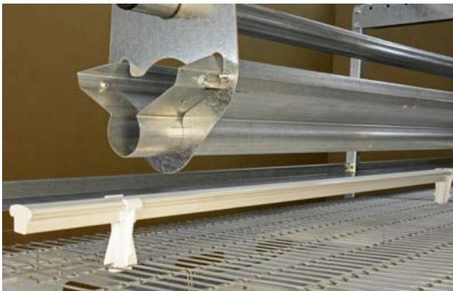
VIKE™ TRADITION™ Aviary System with Perch and side view of ULTRAFLO® Feeder System