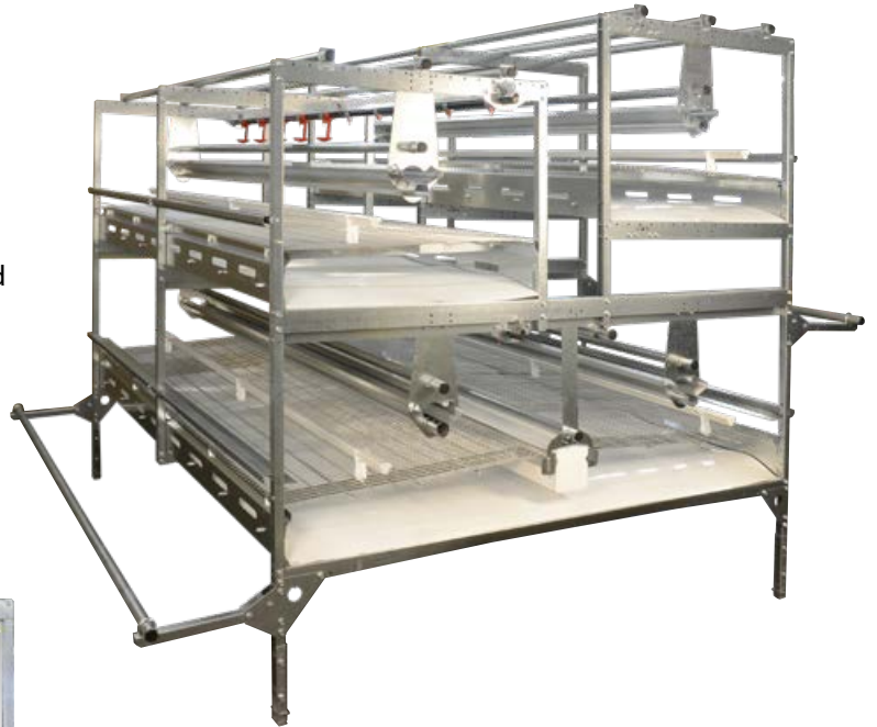
VIKE™ TRADITION™ Aviary System with Perches