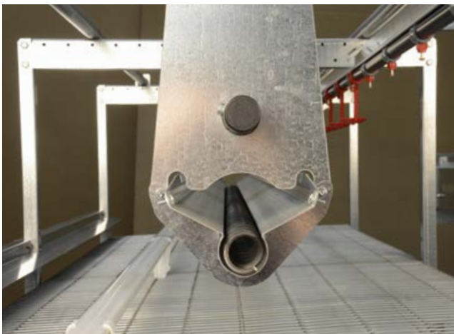
Multiple levels of ULTRAFLO® Feeders and Chore-Time drinkers allow easy access for birds on each level