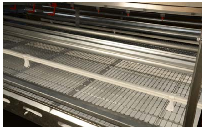
Manure belts on each level keep system and feeding areas clean