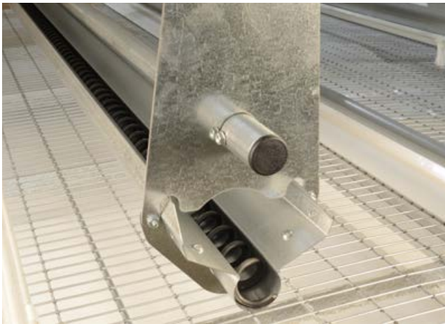
ULTRAFLO® Double-Sided Feeder for Commercial Cage-Free Layers