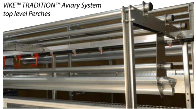
VIKE™ TRADITION™ Aviary System top level Perches