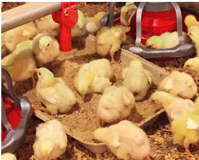
Traditional supplemental feeding during brooding allows chicks to stand in their feed, introducing potential toxins and illness as well as wasting feed.

In the U.S. market and some other regions, it is common for growers to partition off their houses with curtains to start chicks in a smaller brood area. This so-called “partial-house brooding” typically uses half or a third of the house square footage for starting the birds and takes less energy for heat. While this helps save on heating costs, there is usually not enough