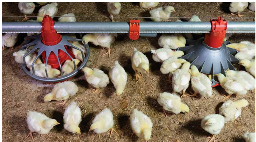
Pan feeders like Chore-Time's KONAVI® feeder (shown at right) let chicks eat from the outside of the pan from the first day and prevent them from standing inside the feeder, helping to keep feed clean.

One of the reasons for supplemental feeding has been the limited feeder space when partial-house brooding. Moving to whole-house brooding eliminates that barrier. The second issue with conversion to whole-house brooding has been providing easy access to feed with traditional pan feeders without birds climbing into the feed. Feeders such as Chore-Time's KONAVI® Feeder now allow chicks access to feed from day one while discouraging them from standing in the feeder.