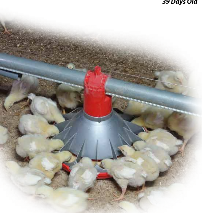
11 Days Old

Adolescent birds may still climb inside gridded feeders. They block access to feed for other birds and contaminate the feed with their droppings.