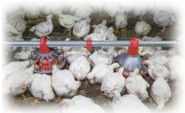
39 Days Old

Adolescent birds may still climb inside gridded feeders. They block access to feed for other birds and contaminate the feed with their droppings.