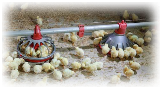
Three Days Old