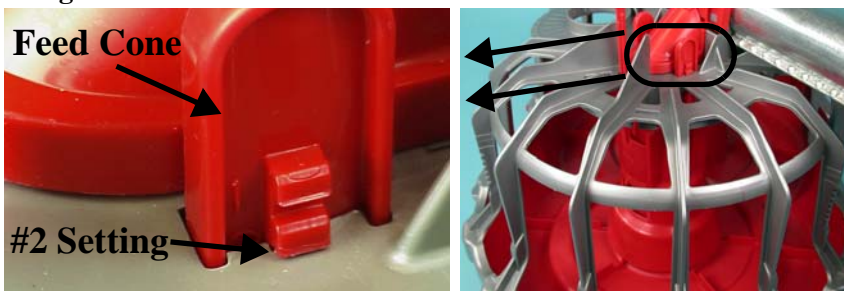
Figure 2. Feed Cone Level #2 Setting