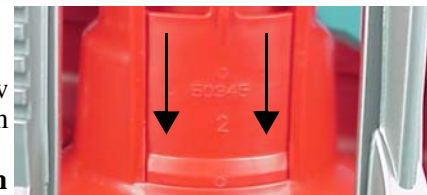
Figure 4. Close Brood Windows