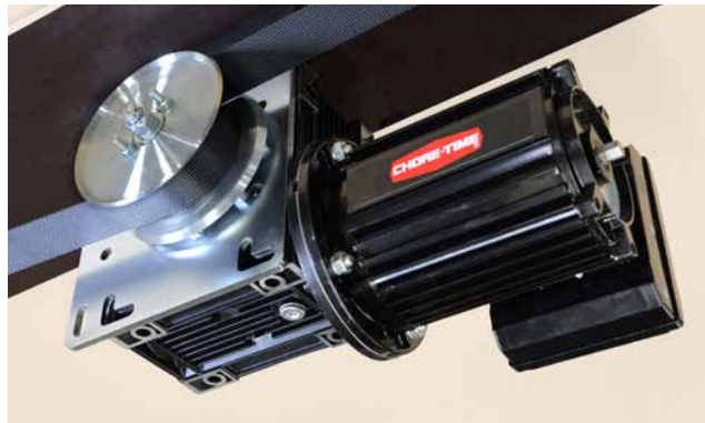
56929 Product may differ slightly from image shown.