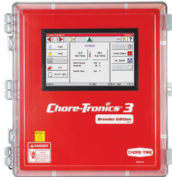
CHORE-TRONICS® 3 Breeder Control includes extra capabilities especially for breeder production.