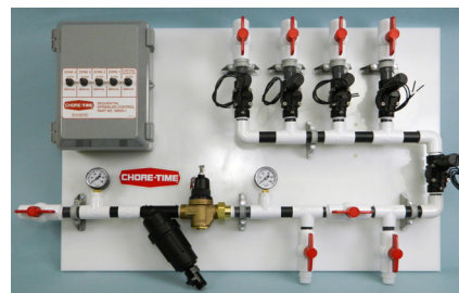
4-zone sequential control panel with doser option shown – one of six available control panel options