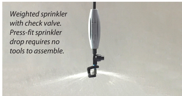
Weighted sprinkler with check valve. Press-fit sprinkler drop requires no tools to assemble.