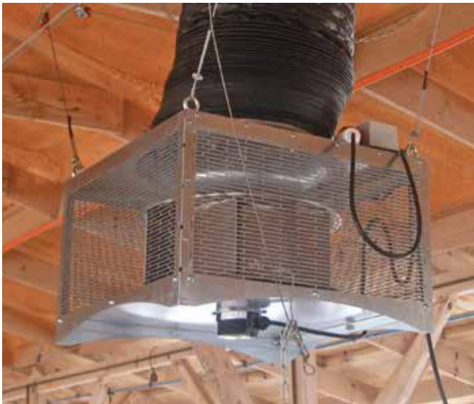
CUBO® Model S/R Destratifier is housed in a zinc-coated steel box with a heavy-duty aluminum fan. Includes a protective grill over the air inlet and a snap-fit intake duct.

Air circulates 360 degrees around the CUBO® S/R, spreading air in all directions throughout the house.