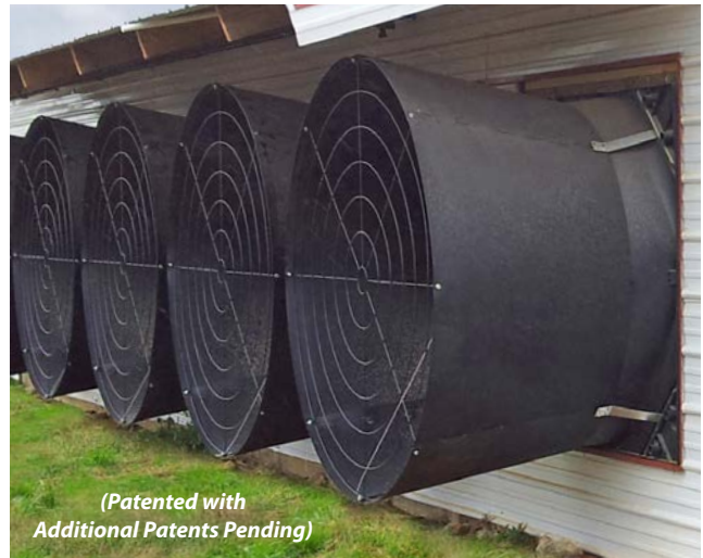
(Patented with Additional Patents Pending)

Chore-Time's 145-cm (57-Inch) ENDURA® Fan with HYFLO® Shutter features an industry-leading combination of outstanding performance and strategic material selection.