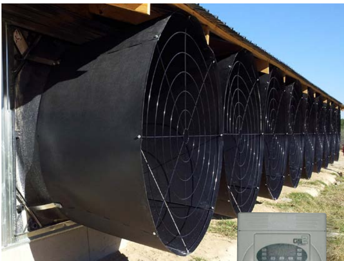
CHORE-TIME® Variable Frequency Drive