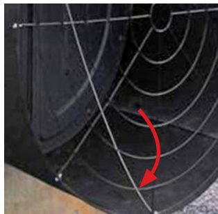
Cable attachment allows HYFLO® Doors to float left or right together for maximum efficiency.