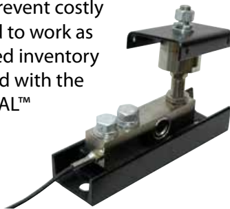
Load Cells handle up to 10,000 lbs. (4,500 kg) per feed bin leg

The CHORE-TRONICS® Feed Inventory System provides an economical way to monitor and manage the feed stored in feed bins on the farm. Producers can easily check feed bin weights by using the CHORE-TRONICS read-out screen. Getting precise weights aids in better managing feed inventories and helps prevent costly out-of-feed events. Designed to work as a stand-alone system, the feed inventory system can also be connected with the company's popular C-CENTRAL™ Software to provide multiple house and remote location monitoring.