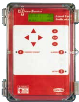
Load Cell Indicator Control is simple to operate for monitoring feed bin weights