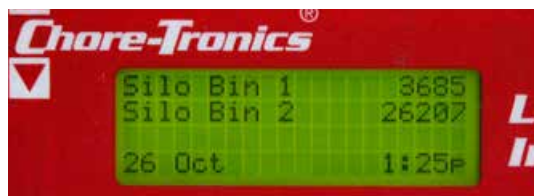
Easy-to-read four-line viewing screen always remains lit