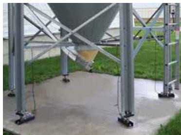
Economical, precise feed inventory management